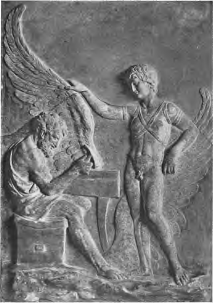
Fig. 73. Dædalus and Icarus.